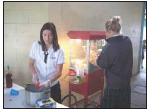
Popcorn and Snowcones

Students were then able to operate their ventures and once completed, had to reflect on their planning. All students worked very hard and most groups had to overcome last minute challenges. At the conclusion of all ventures, the students had revenue of over $550 and a profit of over $400. With attention being paid these days to good corporate citizens, students will donate a portion of profits to charity.