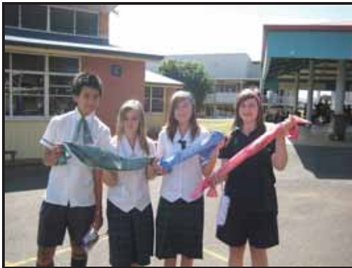
Home-made House Colour Bandannas

The Year 9 business classes have just completed their 'Business Plan' unit. In groups, the students were to plan and operate a school based business venture (goods or service). Ventures ranged from car wash and food items to games and headbands.